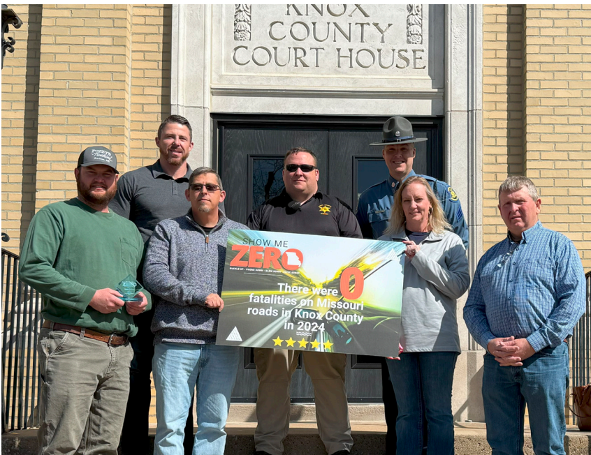
The Knox County Commission and EMS representatives were joined by representatives from the Missouri State Highway Patrol, NEMO RPC and MoDOT to recognize the community's achievement of ZERO roadway fatalities in 2024.